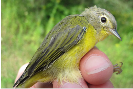
Nashville Warblers don't breed at NBNC, but we caught this one during fall migration.

It is said that “a bird in the hand is worth two in the bush,” and this was certainly the case at North Branch Nature Center, where bird banding was formally launched in the summer of 2011. In bird banding, songbirds are captured in mist nets, carefully removed, identified and measured, and “tagged” with a band before being released. Bands look like little metal bracelets the birds wear on their ankles to help identify them if they are recaptured in the future.