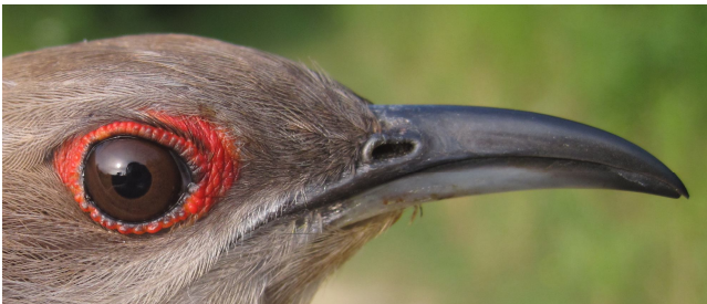
Black-billed Cuckoos are elusive and rarely seen, but catching this adult allowed close examination of its exquisite eye ring. A juvenile cuckoo was also caught this year, indicating that these secretive birds likely bred at or near NBNC

In addition to providing important scientific data, banding has offered a unique way for children and adults at NBNC to connect with birds. Over 75 children and 20 adults attended banding demonstrations, getting an up-close look at how scientists study birds. Some kids even helped release birds, a privilege that has inspired awe, curiosity, and a greater consciousness of how extraordinary birds are.