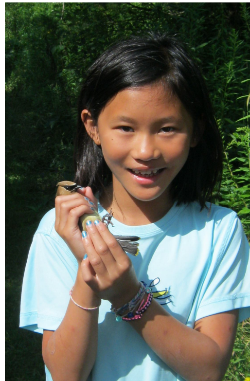
A summer camper delicately holds a Cedar Waxwing before releasing it.